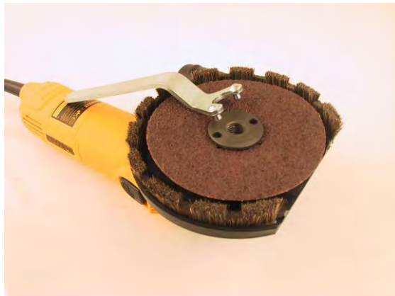
Ø 125 mm Fibre disc