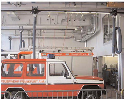
The Vehicle maintenance shop with Exhaust Rail System ALU 150