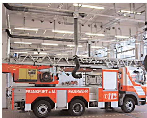
MAGNA TRACK® in Fire engine hall 1

Nederman GmbH won this €200.000 order after a tough battle with Plymovent, Fischer, and other companies. The customer is satisfied with the entire installation. Many visitors from fire fighting authorities across Germany, as well as from other European and overseas countries, will in the near future come to visit this exemplary and modern European Fire and Emergency Centre.