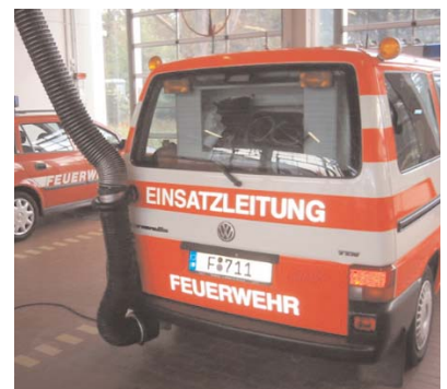
MAGNA TRACK® in the Rescue guard hall